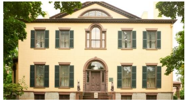
Seward House Museum

Set on a hill overlooking Auburn, this site was used for burial mounds by Native Americans as early as 1100 A.D. The cemetery includes the burial sites of notable figures like Harriet Tubman, William Seward and Martha Coffin Wright