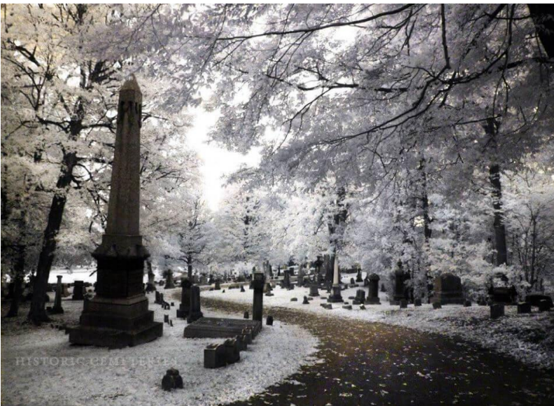
Fort Hill Cemetery

Where you go matters, who came before you matters, come discover the power of this place