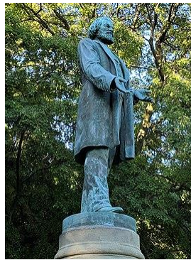
Frederick Douglass monument in Rochester and photo from 1840's