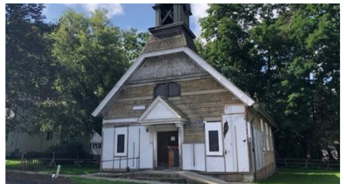
Harriet Tubman National Historical Park

Fellow abolitionists and suffragists, the Seward Family, opened their home to fleeing slaves as a safe resting place