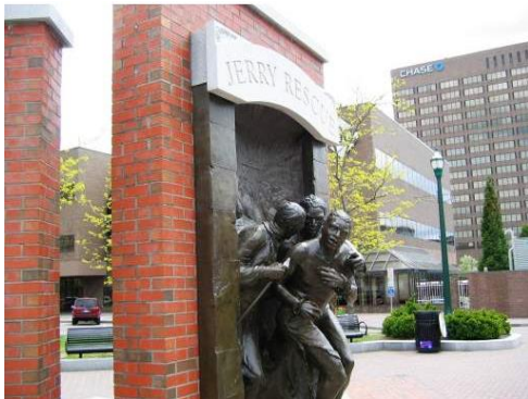
Jerry Rescue monument in Syracuse