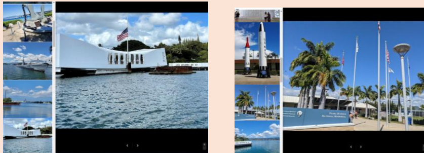
*Pearl Harbor / USS Arizona and Honolulu City Tour

8:00 am - 1:00 pm (Private group transportation for touring - Maximum 6.5 hours) Private group travel with a driver/tour guide to Pearl Harbor with guaranteed tickets to the USS Arizona Memorial. Afterwards, tour members will enjoy a brief Honolulu City Tour.