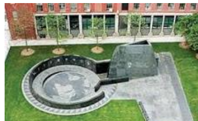
African American Burial Ground Monument

Buffet Breakfast is provided beginning at 6:30 am. Bags should be packed and ready to be picked up at 7:30 am. At 8:30 am group will leave the hotel for the 9/11 Memorial Plaza & Museum . A guided tour of the Memorial will explain the full meaning and symbolic design to enable tour members to appreciate the great care that went into creating the memorial that honors and remembers the victims. Afterwards, group members will tour the 9/11 Museum.