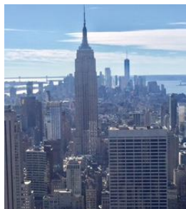
View From Top of the Rock

After lunch (on own), the group will take a guided motorcoach tour including the best of midtown featuring Columbus Circle, Lincoln Center, Central Park, the Chrysler Building, downtown's Greenwich Village, artsy SoHo, the bustling streets of Chinatown, Little Italy's sidewalk cafes and the busy Wall Street area.