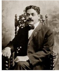
Arturo Alfonso Schomburg

Buffet Breakfast is provided beginning at 6:30 am. At 9:00 am the group will leave the hotel for Harlem to visit the Schomburg Center for Research in Black Culture . Next, a knowledgeable Tour Guide will lead the group on a motorcoach journey through present-day Harlem.